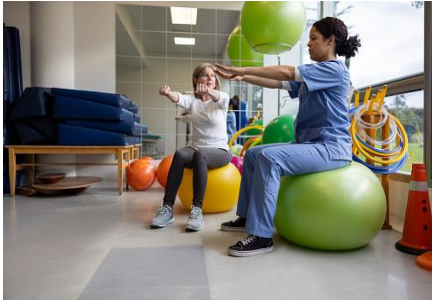
Physical Therapist Assistant