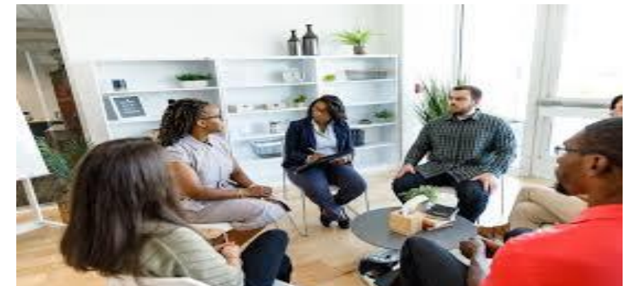
Clinical Mental Health